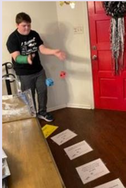
Student rolls the dice to move forward in the Safety Land Game!

The Safety Whys' 25th and last Annual Leadership Adventure was held on February 22 nd . The theme for the event was Candy Land and the students played a variation of the game, the Safety Land Game where they identified safety tips. The game was a big hit and was even taken to another event where it was extremely well received! Thanks to all who submitted safety tips for the game.