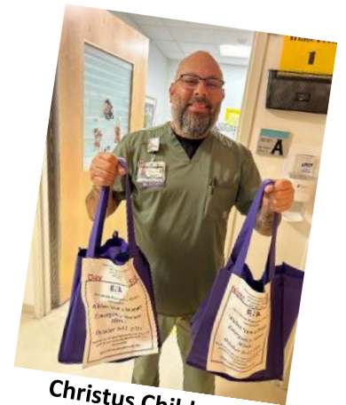
Christus Children's Emergency Center