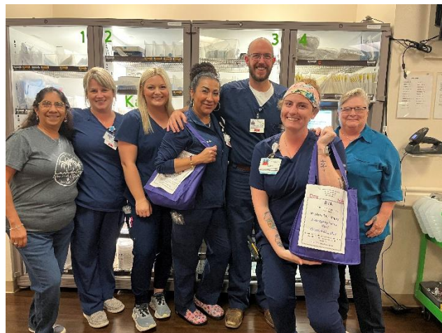
Peterson Regional Medical Center