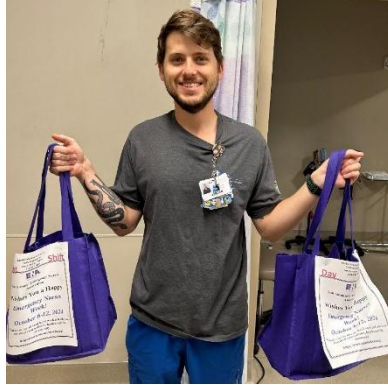
Baptist Medical Center