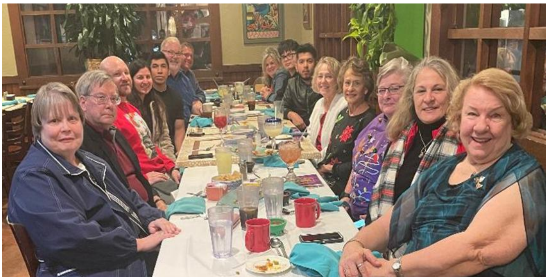
SAENA members and guests