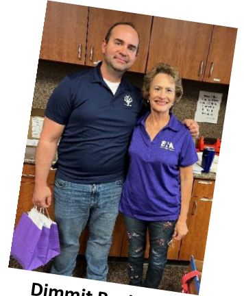
Dimmit Regional Hospital