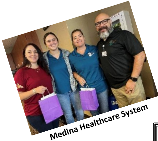
Medina Healthcare System

The SAENA helped nurses celebrate ER Nurses Week by delivering candy and thanks to 84 facilities across the Chapter. It was wonderful to see the hard working nurses and staff in the EDs and freestanding facilities light up when an SAENA member walked in with the purple bag full of sweet treats.