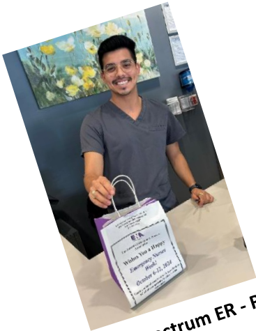
Full Spectrum ER - Rim