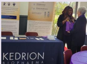
Kedrion – Gold Sponsor