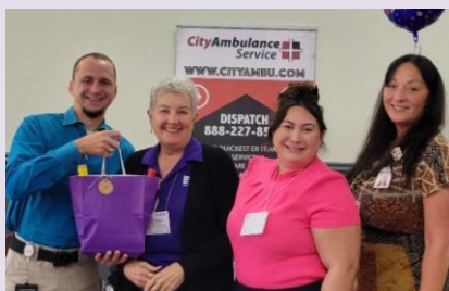
City Ambulance – Gold Sponsor