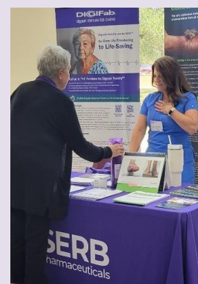
BTG – Bronze Sponsor

Join us next year for the SAENA's educational conference, Concepts of Emergency and Critical Care Nursing – 2025! Watch the SAENA website for more information starting in January 2025.