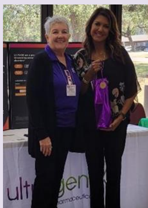
Ultragen – Silver Sponsor