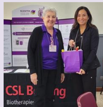
CSL Behring – Gold Sponsor