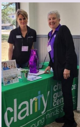
Clarity Child Guidance Center – Silver Sponsor