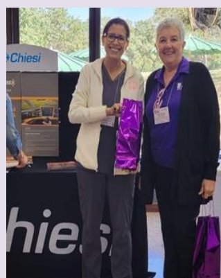
Chiesi – Silver Sponsor