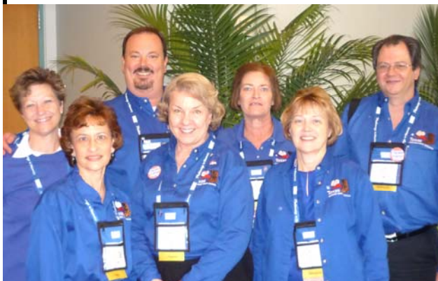
SAENA delegates at the ENA General Assembly

The 2008 ENA General Assembly and Annual Conference have come and gone. San Antonio had seven members serve as voting delegates at General Assembly along with several other members attending the Annual Conference. The weather was very nice and Minneapolis was a great city to visit. Along with attending to business, we took some time out for fun. One evening was spent at the Minneapolis Twins and Kansas City Royals baseball game. The vendor's displays were also a highlight of the trip. It gave everyone a chance to visit with each vendor and see what new products they have. The 2009 Annual Conference will be held in Baltimore, MD on October 8th through 10th. Information is available on the ENA website, www.ena.org . Begin making your plans now to attend.